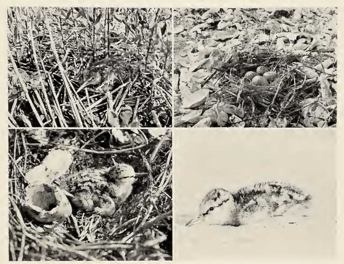
Fig. 2. (Upper Left) Typical concealed nest. (Upper Right) Atypical nest, not concealed. (Lower Left) Newly hatched young, with eggshell, showing the characteristic breakage of normal hatching. (Lower Right) Young Willet, about 2 days old. The plover-like bill and the down pattern, characters which may not be evident in dried specimens may be seen clearly.

bird can cover. Both birds are known to share in the incubation duties and neither has a vascular brood patch. One nest contained two eggs of Wilson's Plover in addition to a full clutch of Willet eggs. After some of the Willet eggs hatched, and the birds abandoned the nest, I opened the plover eggs and found that they contained nearly full-term embryos.